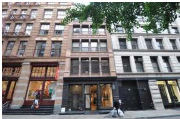
100 Wooster Street.

Balmain , which recently opened a London flagship, is preparing to establish its U.S. presence at Crown Acquisitions' 100 Wooster Street .