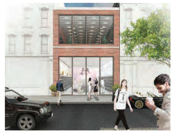
OPTIONAL SECOND FLOOR

FIRST FLOOR: 3,500 SF SECOND FLOOR: 3,500 SF